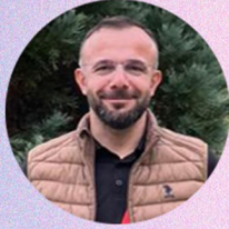
Mustafa Numan Bucak